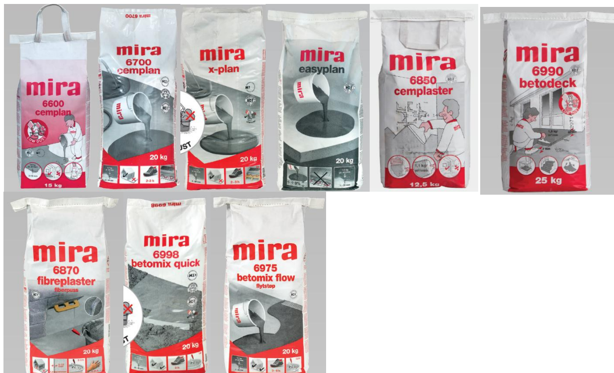
Figure 1: Picture of products